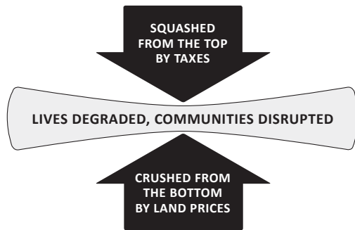
Graph 1 The Fiscal Pincer